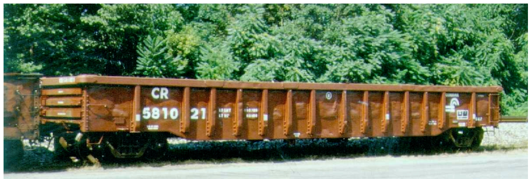
G47 in fresh Conrail paint near Thompsettown, PA 1998.