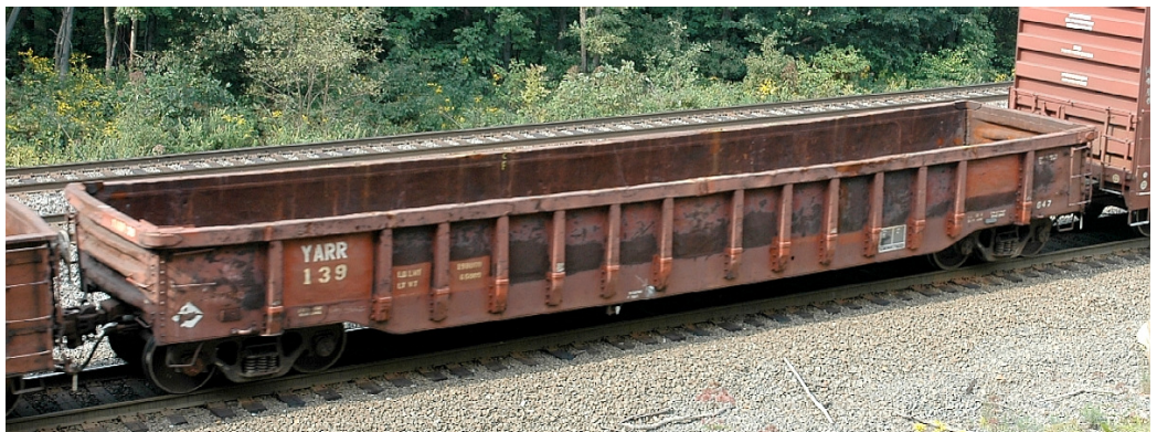
YARR 139 is an ex-Conrail G47 seen at Cassandra, PA on September 10th 2007.