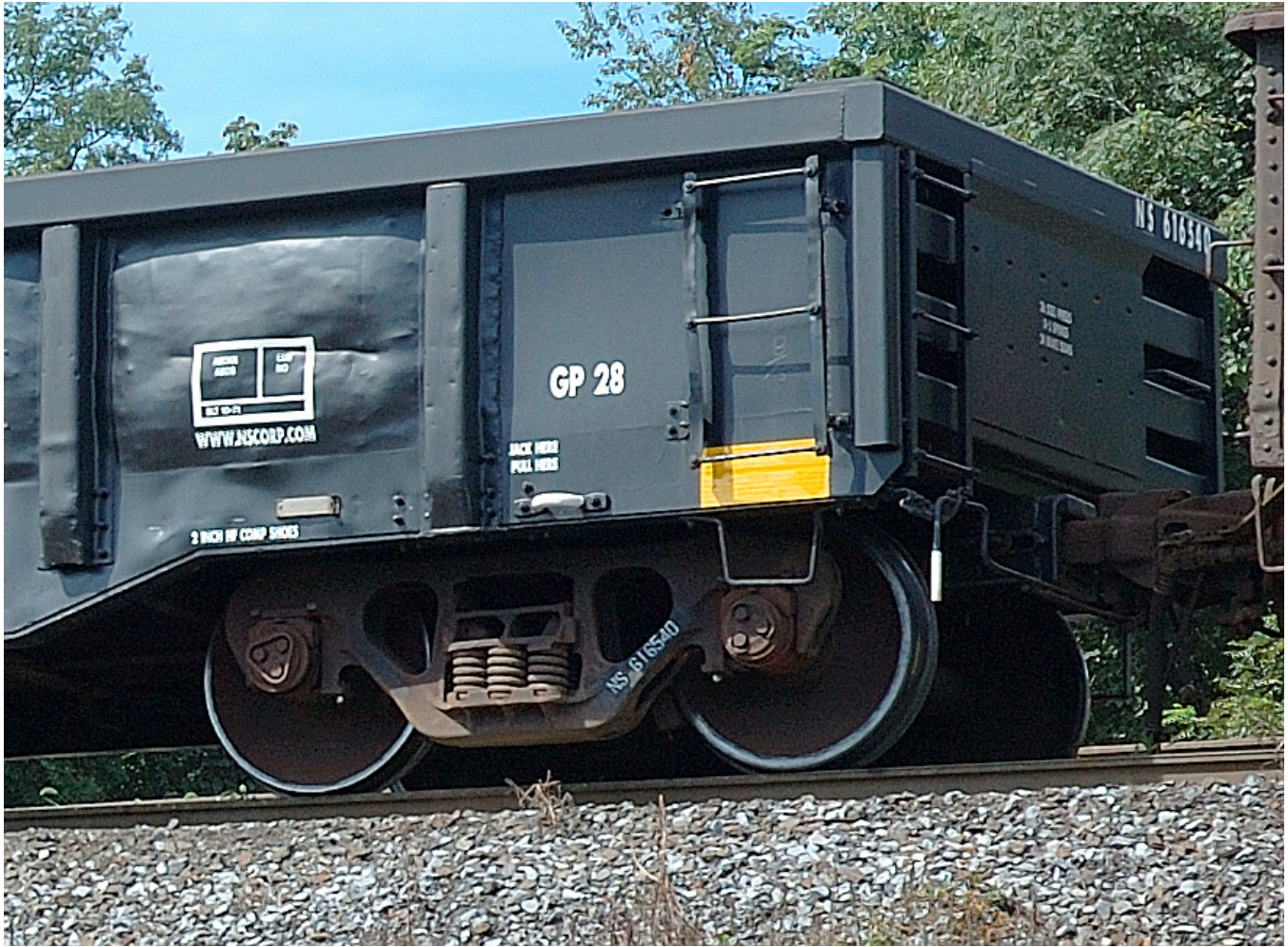
Norfolk Southern GP28 (rebuilt ex-Conrail G47) Note the new end panel and side sheet.