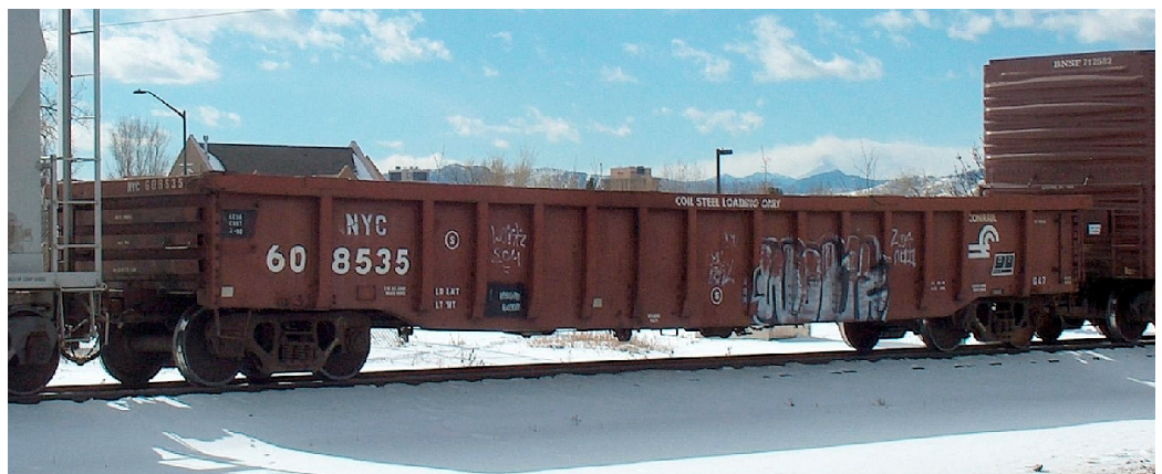
NYC (CSX) marked G47 in Ft. Collins, CO, 2004.