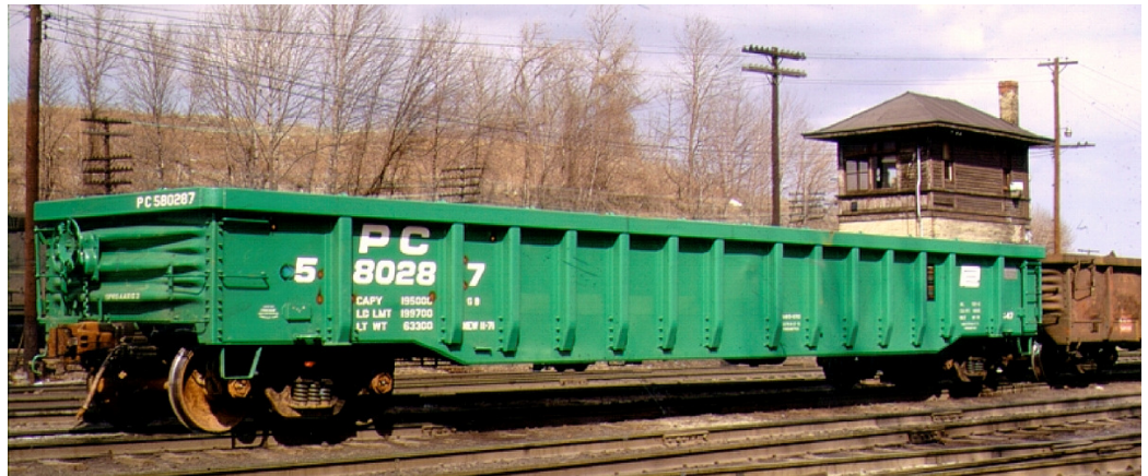
G47 in Allentown, PA.

Gondolas typically see very rough service and are frequently damaged. The G47 class was no exception. Photographs of these cars over their history show them with at least three variations of end panels. As built, these cars had three rib dreadnaught ends. As ends were damaged, replacement panels would be installed. Photos showing what appear to be three rib Pullman/Despatch styled end panels as well as ends fabricated from steel plate and three steel channels have been found. Sometimes with different styles on the same car. Repairs and repaints to these cars have been found as early as 1975.