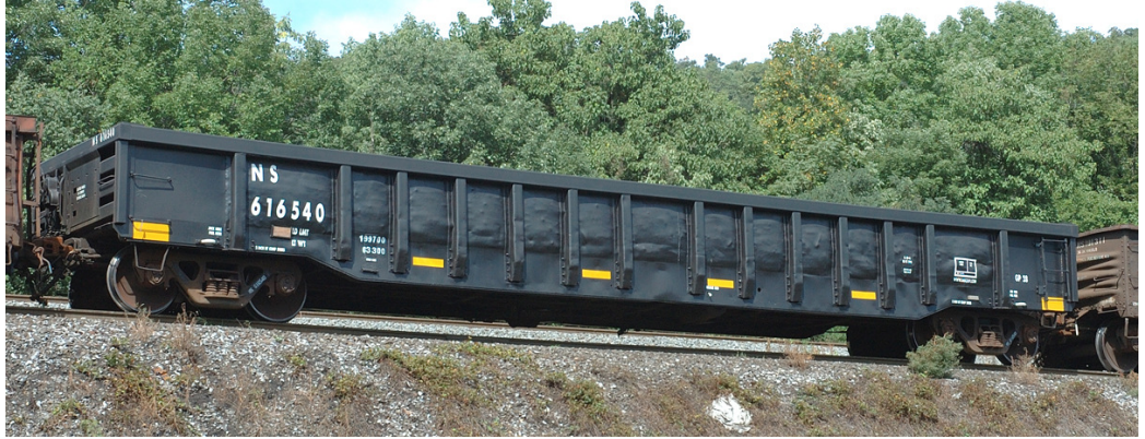
Norfolk Southern 616540, a class GP28 gondola in slab steel service at Enola, PA. 16 September 2007.

It also appears that NS and CSX are selling or leasing off some of their G47 fleet. G47 cars have recently been seen wearing YARR reporting marks. YARR is the Youngstown & Austintown R.R. which is a part of the Ohio Central Railroad System.