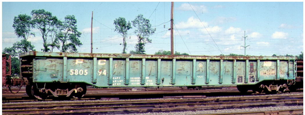
G47 in PC Repaint.