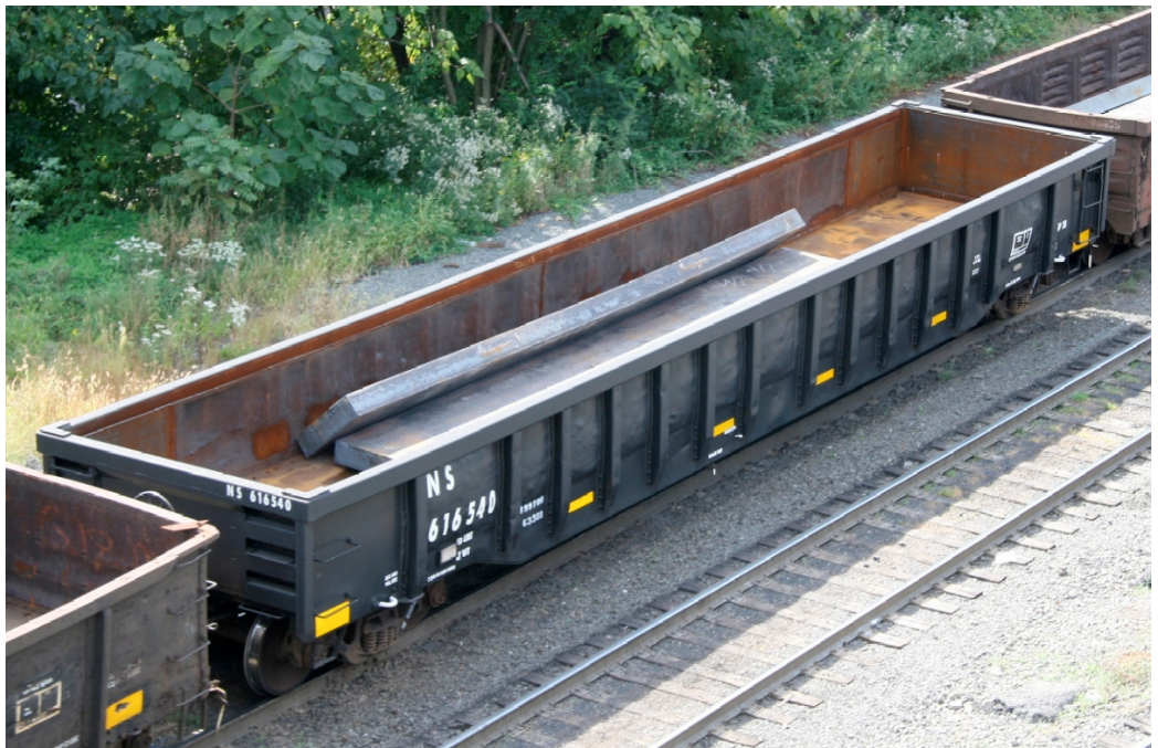
Norfolk Southern 616540 shown from above at Enola, PA. 16 September 2007.